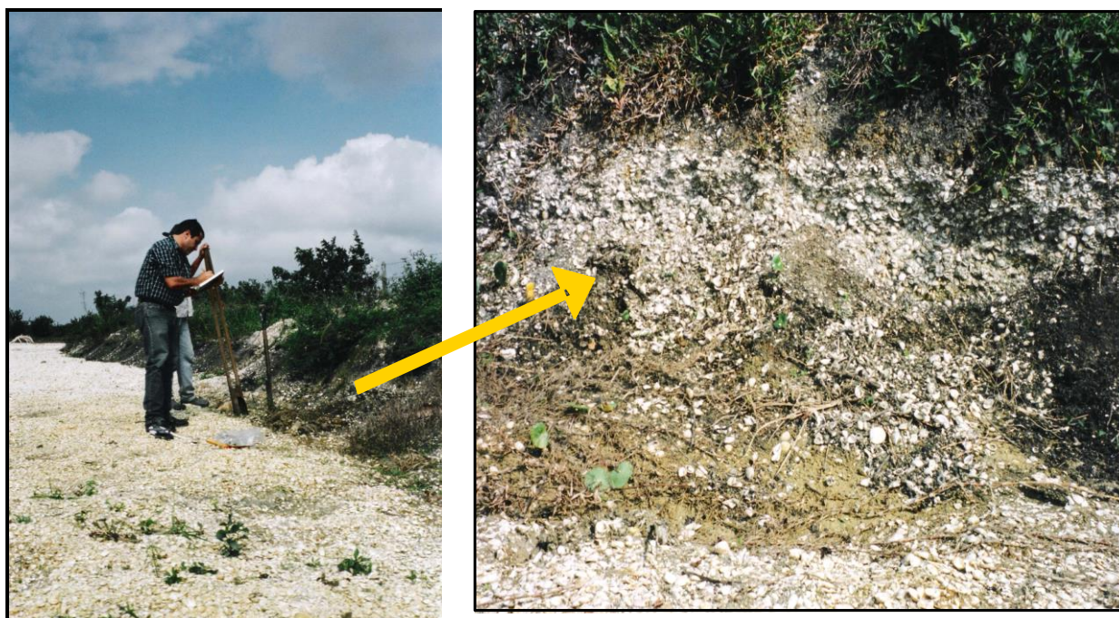
Figure 2 - General and detail aspect of the molusk shells outcrop “coquina” in the Reserva Tauá area - Malhada marsh / Rio de Janeiro State.

during the period in which the Reserva Tauá paleolagoon was formed (Castro et al. , 2004).