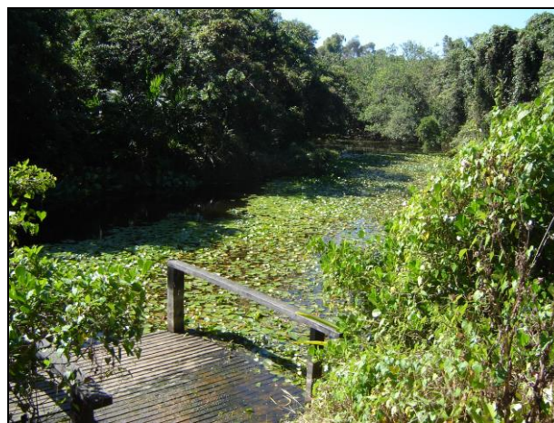
Figure 4 - Physiognomy of the restinga vegetation, Reserva Tauá - Malhada marsh.

The rest of the area surrounding the outcropping is made up of fields of grass species, subsistence agriculture and (in the lowlands) urban areas.