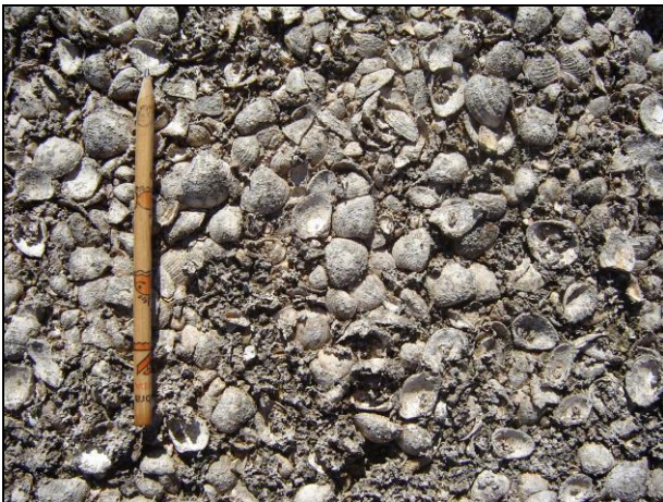
Figure 5 - Spatial distribution of the mollusk shells with notable organization pattern

imbricated and articulated, demonstrating a notable nesting pattern (Fig. 5 and 6).