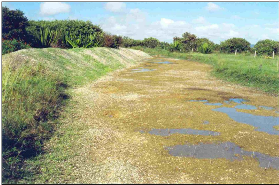
Figura 7 - Remoção da camada de solo, área do afloramento de coquina - Reserva Tauá.

The owner of the Reserva Tauá maintains a corps of permanent guards in order to protect the area's biological and geological integrity. This, however, is not enough to guarantee the preservation of this important site. Other measures are necessary in order to establish the Reserva as an unquestionable part of the national and global geological patrimony.