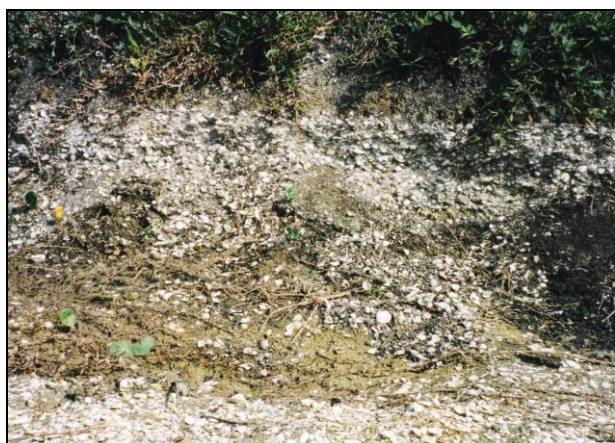
Figure 3 - Stratigraphic positioning of the molusk shells outcrop “coquina” Reserva Tauá - Malhada marsh / Rio de Janeiro State.

The current marsh environment developed due to a rapid decline in the region’s sea-levels, occurring around 4,900 years ago, which led to dunes forming along Però and the closing of the canal linking the paleolagoon to the open sea. Current environmental conditions in the region of the Tauá geological site are of a tropical climate with semi-arid characteristics, pluviometric readings of approximately 850 mm/year, northeastern prevailing winds and southeastern secondary winds. Along the northeastern border to the outcropping, one encounters an area of vegetation made up of sandbar environment bush and tree species. This is the private property of the environmentalist Tereza Kolontai Soldon (Fig. 4).